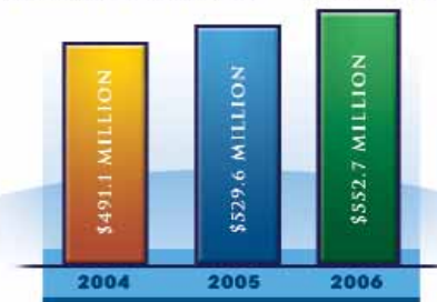
TRIMAS REVENUE - 6 MONTHS

It is my hope that each of you had a safe, enjoyable summer. I wish to thank you for your efforts and hope you are as proud as I am to be part of the TriMas family!